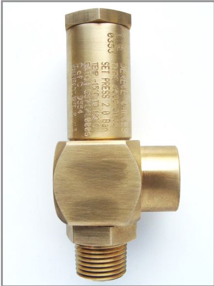
Base appearance may differ between sizes

SAFETY RELIEF VALVE SIDE OUTLET DISCHARGE COMPLETE WITH SEALED COVER